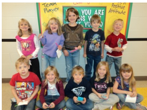
First Grade November Birthdays